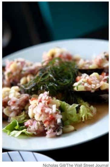
Mussel ceviche at Los II Piratas