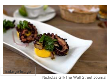
Grilled octopus at Pescados Capitales

followed by a saltado (Peruvian stir fry), served sweet or salty. If you want something else or fish prepared in a different way, you'll have to go elsewhere. Enrique León García 114, La Victoria, 470-6217